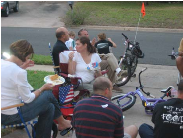
Aragon, Biscay, Cordova (ABC) National Night Out Pictures