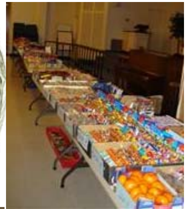
Tables of goodies for the officers