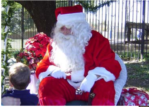
Fun with Santa and treats at the North Pole